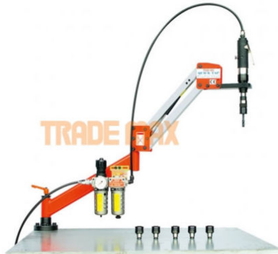
Product Name : Pneumatic Tapping Machine Type AQ Model : AQ-08,12