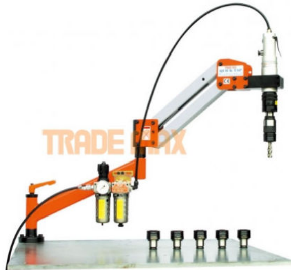
Product Name : Pneumatic Tapping Machine Type AQ Model : AQ-16,20,22,24,27,30